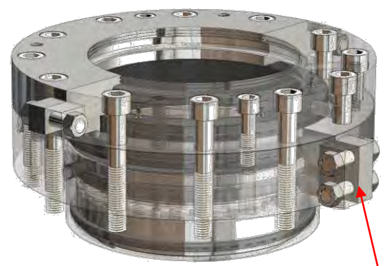
Tori Seal MB2910